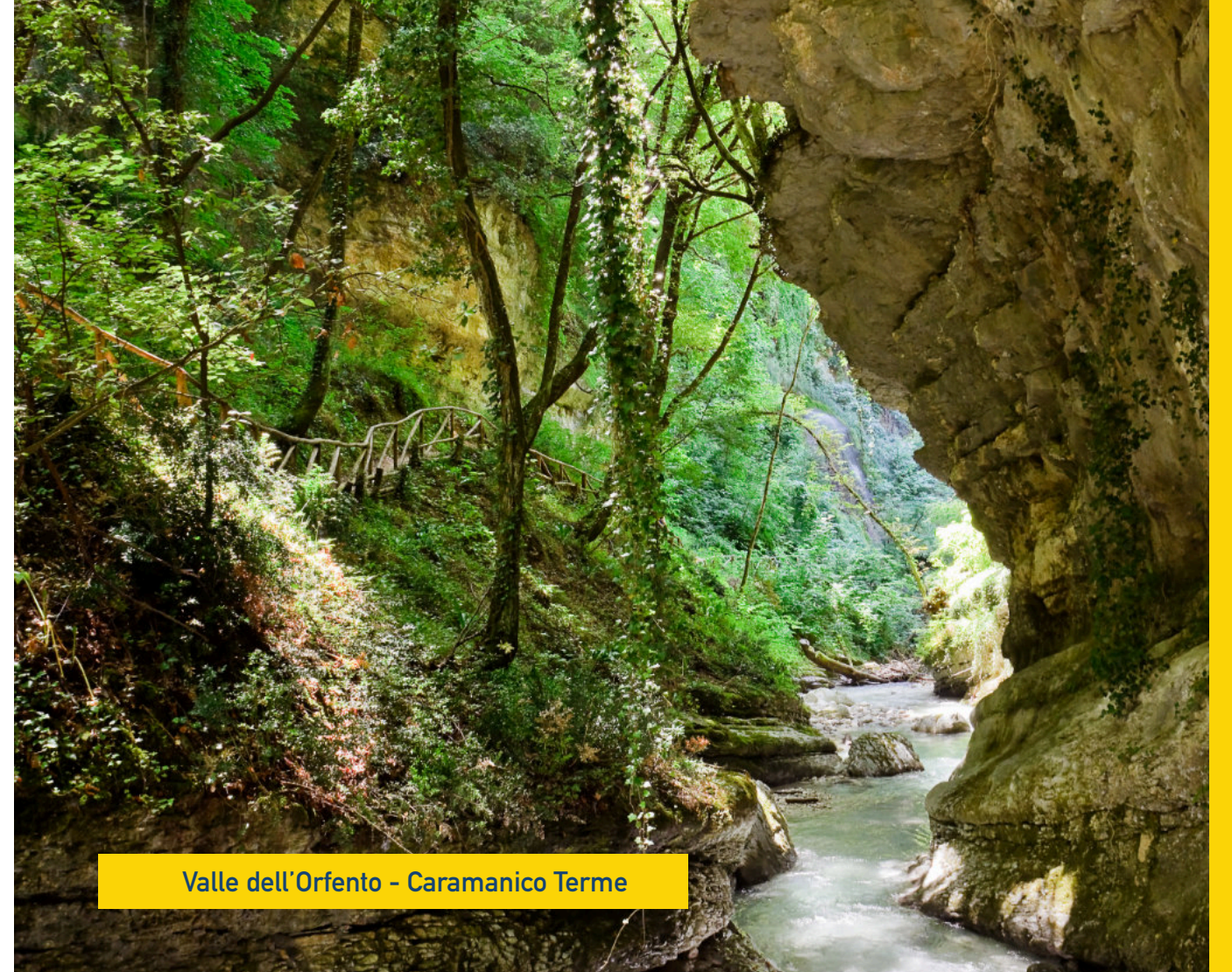
Valle dell'Orfento - Caramanico Terme