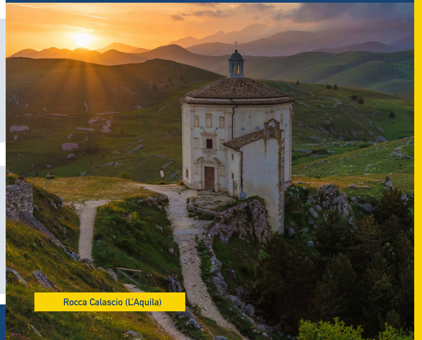
Rocca Calascio (L'Aquila)

Return journey to and from Torino di Sangro, quotation on request The packed lunch on the 1st day Everything that it is not specifically listed in the What's Included paragraph.