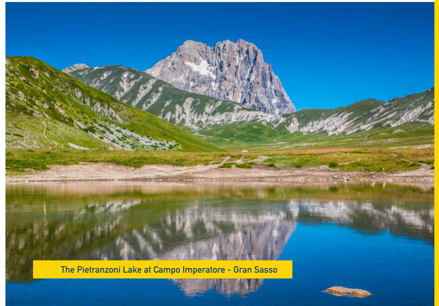
The Pietranzoni Lake at Campo Imperatore - Gran Sasso