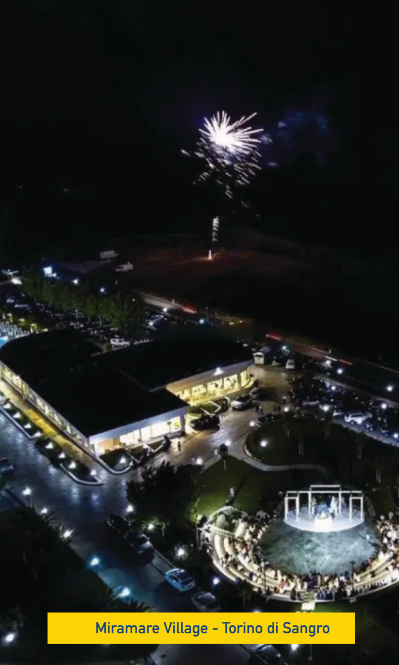
Miramare Village - Torino di Sangro